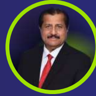
Mirza Ikhtiar Baig Member of the National Assembly of Pakistan