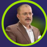
Sharjeel Memon Member of the Provincial Assembly of Sindh